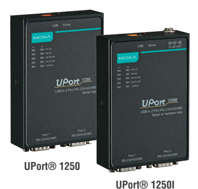
> Hi-Speed USB 2.0 for up to 480 Mbps USB transmission